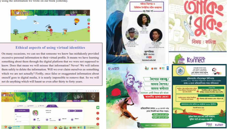
Caption: Page 60, Chapter: Virtual Identity, Grade 7: Digital Technology, NCTB

Digital Technoloy Session-4: Let's Create a Virtual Identity for Myself Today we will register for Kishore Batayan. We will complete the registration proce by using the information we wrote on our book yesterday.